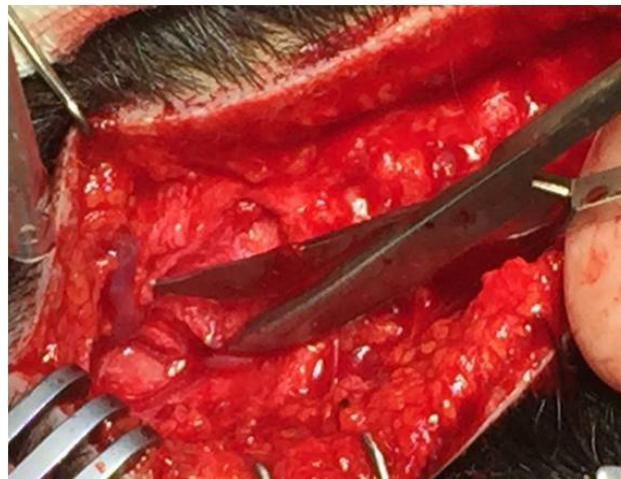
Figure 4: Aberrant left occipital arteries compressing the left occipital nerve.