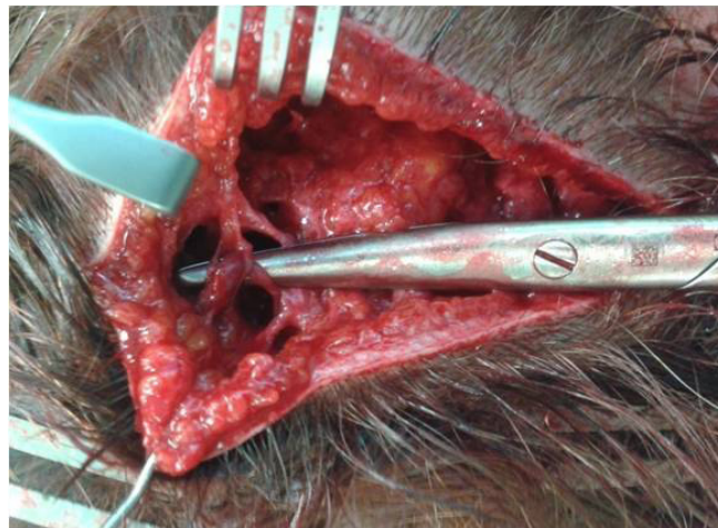
Figure 3: Dilated left occipital artery constricting the left great occipital nerve.