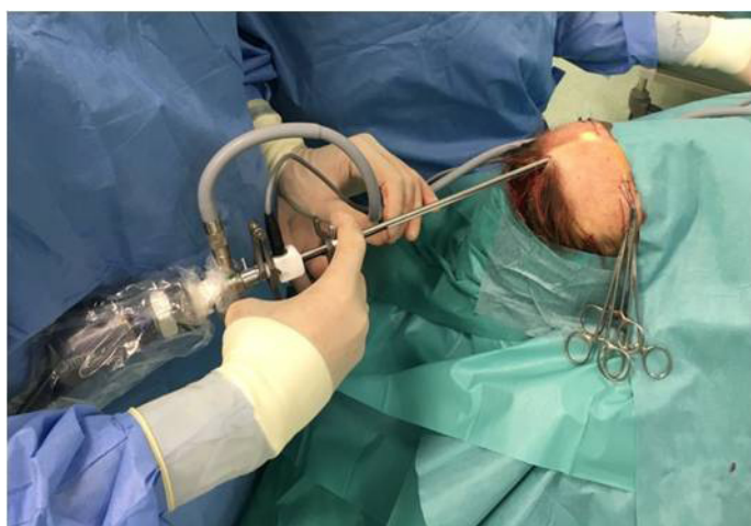
Figure 1: The endoscope is inserted through one incision in the subgaleal plane until the superciliary region is reached, in order to perform the section of the corrugator supercillii, depressor supercillii, and procerus muscles (this picture belongs to Prof. Edoardo Raposio).

Temporarily anesthesia occurs in all patients, which last 163 days on average [5,8,12-15]. Other minor and transient complications reported are: lasting occipital numbness at 1 year (5.7%), intense itching after surgery (5.7%), hypertrophic scar (2.7%), incisional cellulitis (1%) that resolve with oral antibiotics, transient mild incisional alopecia or hair thinning (5%), lasting neck stiffness at 1 year (9%), postoperative epistaxis (4.8%), early sinusitis in the recovery period following septum and turbinate surgery (4.8), slight septal deviation recurrence (12.9%) [3,5,8,9,12-17]. Almost 54% patients undergoing temporal surgery reported slight hollowing of the temple [5]. All patients that were refractory to surgery did not report worsening in their MH at any follow-up. Since the operation does not cause any serious complications or side effects, it can be recommended to patients with severe forms of migraine and symptoms of drug dependency. These patients still have a 50 percent chance of responding with partial or even total relief of their headaches.